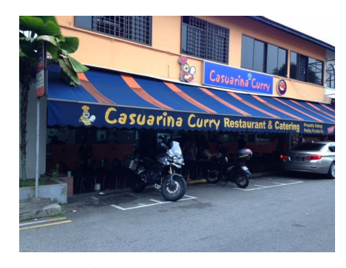
1. Meeting Point

Contact Person Gabriel Teh +65 9679 2621 tehgab@singnet.com.sg