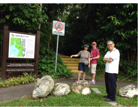
2. (Our Entry) Casuarina Entrance point

For additional information on Lower Peirce, please refer to National Parks' website below >> <a href="mailto:nparks.gov.sg">nparks.gov.sg</a> - Lower Peirce