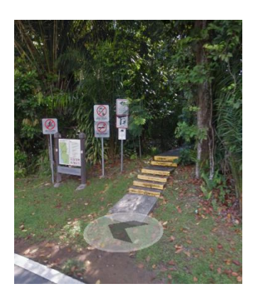
3. (Our Exit) Jacaranda Entrance point